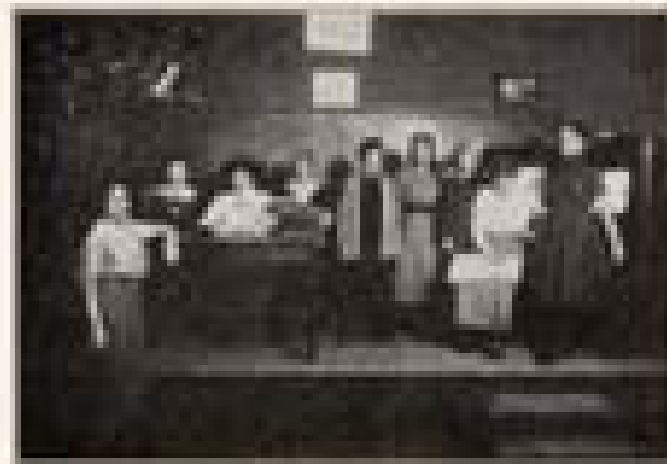
MEMBER OF THE ORPHEUM TRUPE