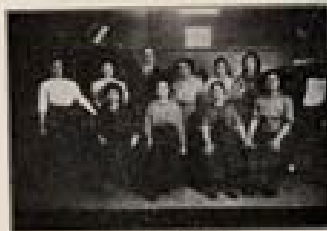
THE WELFARE CLUB